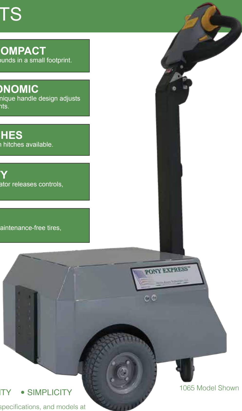
1065 Model Shown

Industry-leading warranty, maintenance-free tires, on-board smart charger.