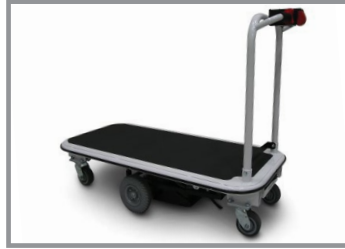
1032: 3,000 - 4,000 LB. CAPACITY